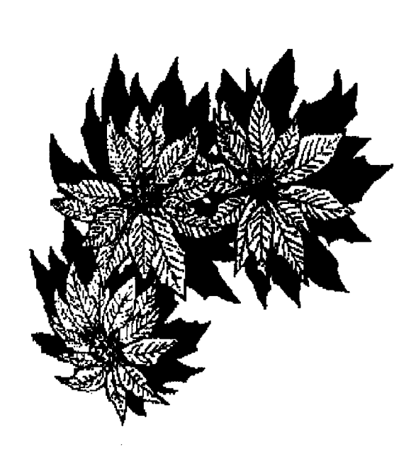
(continued on page 7)

It's no wonder then that by looking for Jupiter's placement in a chart or by noting which planets are in the Sagittarius houses we can determine the