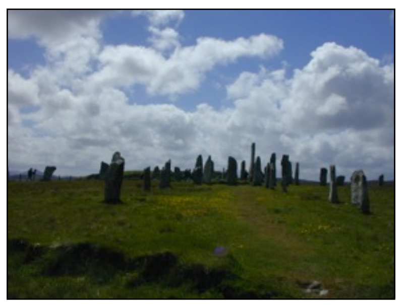
The Stones of Callanish, Outer Hebrides.

I just don't know how people move through this world without astrology. I mean, we're living in such a complex, new world, none of the old paradigms work anymore. We're like geese, waking up in a new location everyday. Of course if you've been reading this newsletter you know these feelings come from Pluto being in the new sign of Capricorn. In fact, every time Pluto changes signs due to its movement through the zodiac, we feel a sense of major change. That