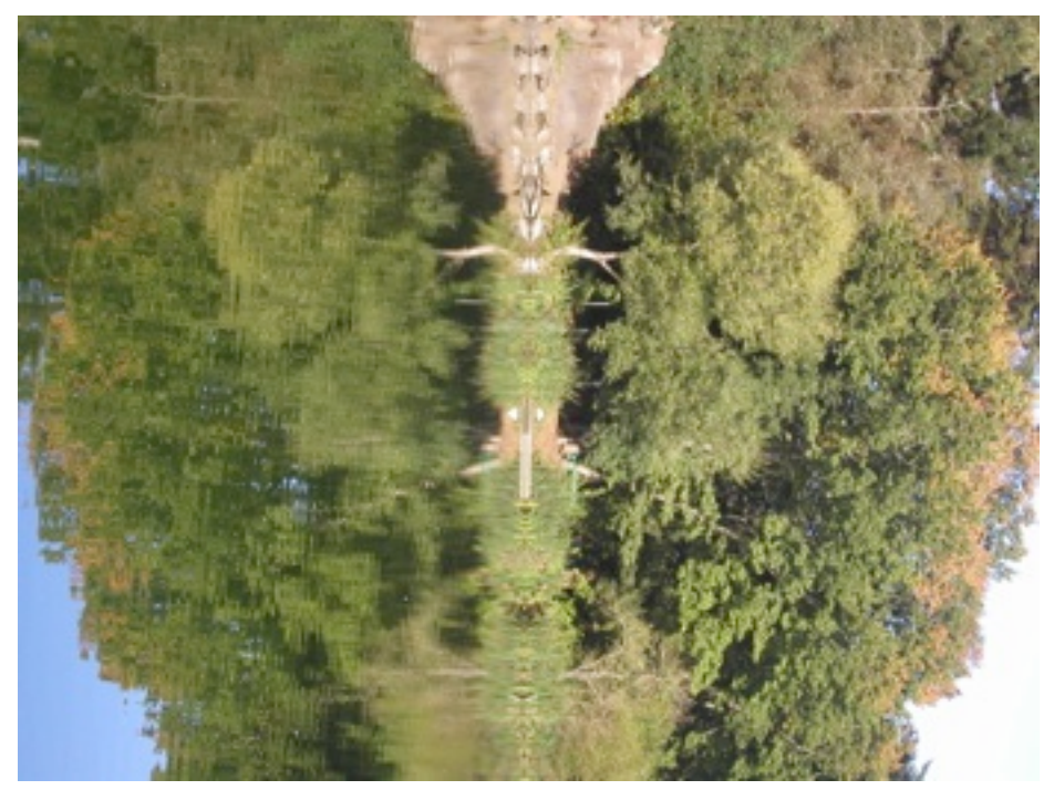
Stowe Lake, San Francisco, CA 2003

"We're in a free fall into future. We don't know where we are going. Things are changing so fast and always, when you are going through a long tunnel, anxiety comes along. And all you have to do to transform your hell into a paradise is to turn your fall into a voluntary act. Joyful participation in sorrow and everything changes."