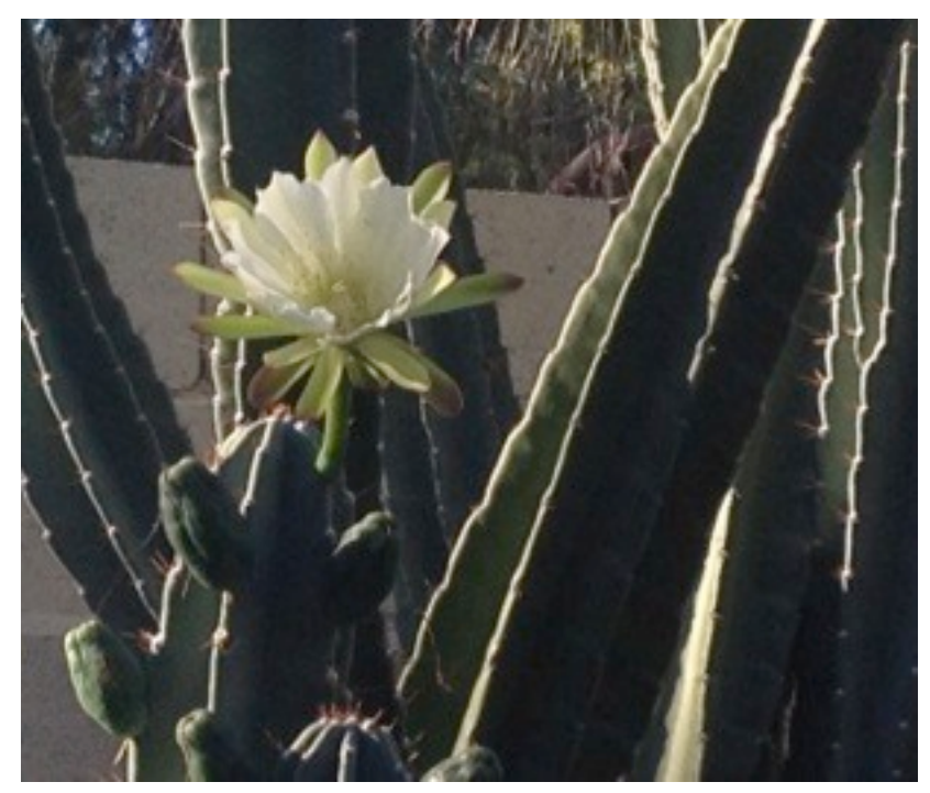
Night blooming cereus, Phoenix 2013

We're in a free fall into future. We don't know where we are going. Things are changing so fast and always, when you are going through a long tunnel, anxiety comes along. And all you have to do to transform your hell into a paradise, is to turn your fall into a voluntary act: joyful participation in sorrow and everything changes. Joseph Campbell