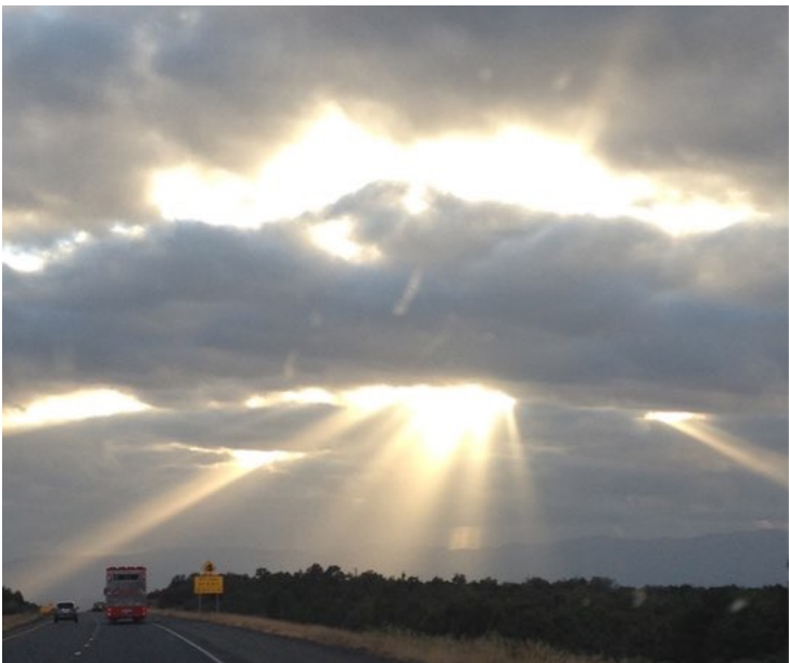
Coming home, Santa Fe, 2014

To know means to record in one's memory. But to understand means to make part of oneself.