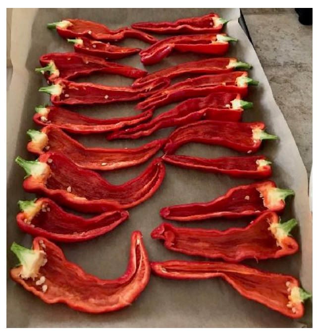
Hot summer in Santa Fe!

too, but it's a great challenge to stay current with all the new technologies.