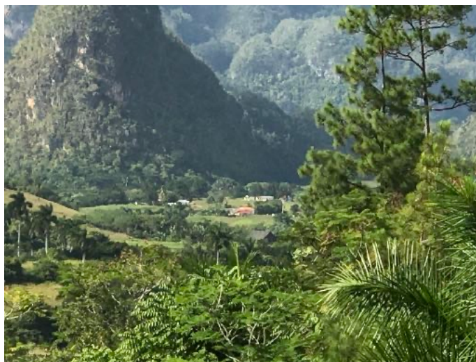
Cuba - Valle de Viñales

We also have Healthcare issues. The medical profession is a mess: overcharging, sending seriously ill patients into debt, despite the so-called health care act. And pharmaceutical greed. Then there is Covid!