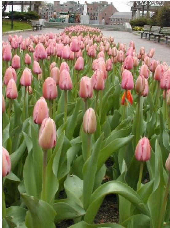
Tulips - Copenhagen - V. Cornell

We are also beginning to see the dichotomy of Neptune, combining the opposites under one archetype. Compassion and cunning, spiritual and satanic, dreams, delusions, and the search for the Truth, healing and self-destruction. And anything to do with cells: cells of the body, prison cells, cells in a monastery! And drugs: drugs that heal and drugs that are toxic. A good example is the opioid manufacturer Purdue Pharma which finally pleaded guilty to fraud. But there is also toxicity that gets into the body without the body knowing, passing through a semipermeable membrane. Neptune also